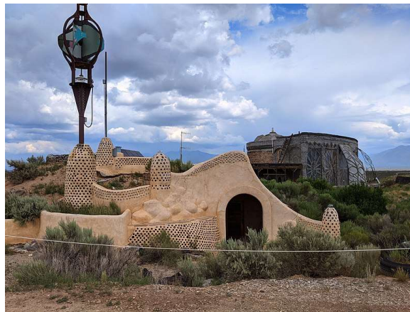
Fig. 3. Example of Earthship [42]

Earthships are located in more than 40 countries and are located across all the climatic zones [7]. Their purpose ranges from residential buildings or schools to hotels or museums.