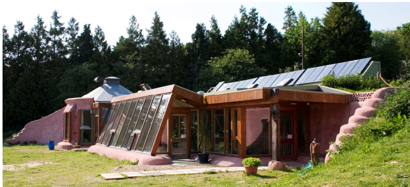
Fig. 2. Example of Earthship - Brighton Earthship [3]

Figures 2 and 3 show examples of built earthships.