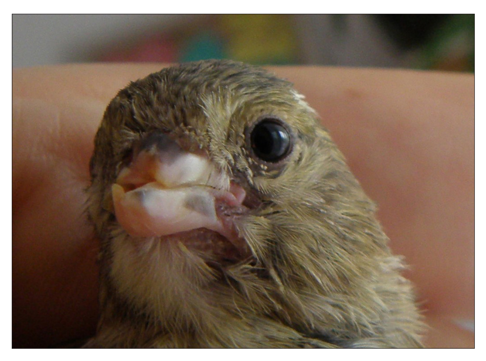
Fig. 3. Canary C at the age of 6 months after correction of the beak. Author: Aleksandra Ledwoń