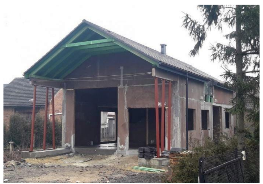
Fig. 7. Two storey house in Wyry - construction site