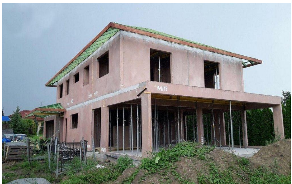
Fig.5. Two-storey house in Gliwice – installation of the roof