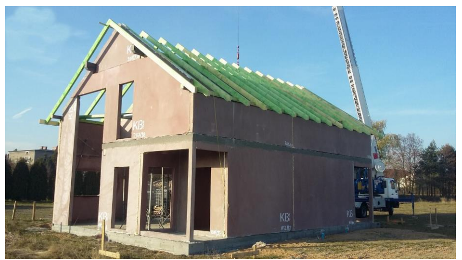
Fig. 6. Two-storey house in Wyry - installation of the roof