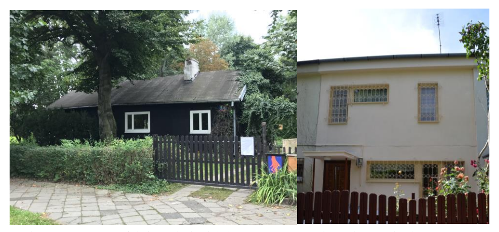
Fig. 1. Warsaw prefabricated Finnish houses (1945) and row houses in the Prototypy estate (1960s, today additionally insulated)

The idea of prefabricating single-family building structures has been explored in theory and practice by some of the greatest creators in the history of architecture. Classic examples include: Le Corbusier's theoretical Dom-Ino project (from 1914), the Dymaxion House planned for mass production designed by Richard Buckminster Fuller (1920), the concept of the Baukasten in Grossen system by Walter Gropius and Adolf Meyer (1923), Ernst May's Praunheim estate buildings in Frankfurt (1926-1930), Walter Gropius' prototype house No. 17 at the Werkbund exhibition in Stuttgart (1927), Robert Krafft and Walter Gropius' Copper Houses (Kupferhäuser) (1930-34). More contemporary examples include Warsaw's so-called Finnish houses (1945, Fig.1), prototype houses built during the years of the Case Study House program in the USA (1945-1966) by, among others, the Eames couple, Eero Saarinen, Richard Neutra, the Oriental Masonic Gardens estate designed by Paul Rudolf (1970) in New Heaven, row houses erected using large-panel technology in the Prototypy estate in Warsaw (1960s, Fig.1), the Cellophane House designed by the KieranTimberlake studio and temporarily erected in New York (2008) for the exhibition Home Delivery: Fabricating the Modern Dwelling (at MoMA), the Oxley Woods estate of Rogers Stirk Harbour and Partners office in Milton Keynes (2007), part of the buildings of the Port Loop estate of Shedkm architects in Birmingham (2020). [1,10,14,19,22,23,26,26,29,31,34,35,36].