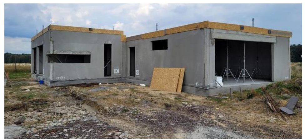
Fig. 3. Single-storey house, Rachowice - photo during wall installation

extensive glazing opening the view to the terrace. The garage part is protruding from the rest of the building. Since the entire functional program of the building is located on one floor, the built-up area is large (225m<sup>2</sup>), and the body is fragmented. Other parameters of the building and the following buildings are included in Table 2. The walls of the building were constructed of expanded clay concrete, the whole was covered with flat roof, the structure of which is filigree type plates. Fig. 3 shows the stage of construction after the completion of the floor casting, the formwork for the concrete slab is visible.