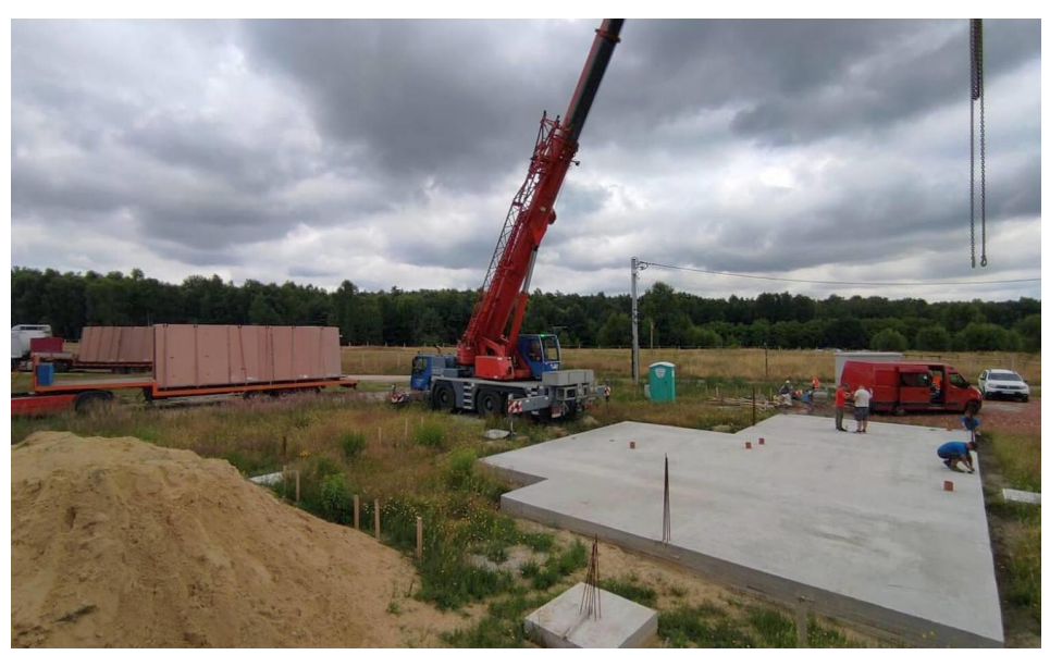
Fig. 4. Two-storey house in Pilchowice, concrete foundation slab and installation of prefabricated walls is started