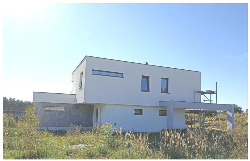
Fig. 4b. Two-storey house in Pilchowice, concrete pergola