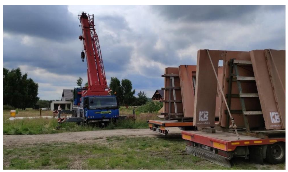
Fig. 2. Expanded clay concrete panels

One of the most spectacular uses of expanded clay concrete in architecture is the canopy at the Portuguese pavilion erected for the 1998 Expo in Lisbon, designed by Álvaro Siza. This iconic building still surprises today with its concrete cable-hung canopy with a span of more than sixty meters and a thickness of only 20 centimeters. To reduce the dead weight of the structure, a special concrete was developed using expanded clay as aggregate.