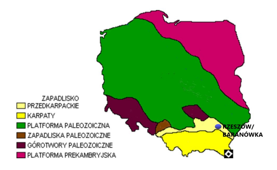
Fig. 2. Geology of Zapadlisko Przedkarpackie [6]

In terms of geology, the research area is located within the Zapadlisko Przedkarpackie (Fig. 2)