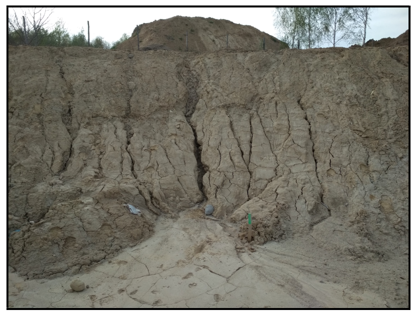
Fig. 4. Rills and gullies due to surficial runoff in silty soil [31]

Under the influence of water, loess-like are blurred, and as a result, rills and gullies are formed on their surface, and this type of damp soil becomes plastic (Fig. 4).