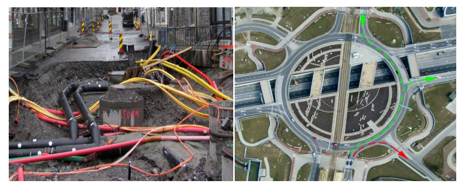
Fig. 13. Location of cables and pipes of underground integrated installations introduced into existing development [26]

In such designated courses of technical corridors it will be possible to successively introduce new types of installations, e.g. structured cabling used for managing already existing or newly-designed IT infrastructure[Fig.11]. An example of this type of cable installation infrastructure is a network of signaling, alarm and warning systems, Building Management Systems (BMS) – intelligent systems for building management, CCTVIP television (VvoIP), and digital ISDN telephony and multi-media transmissions within the network [Fig12].