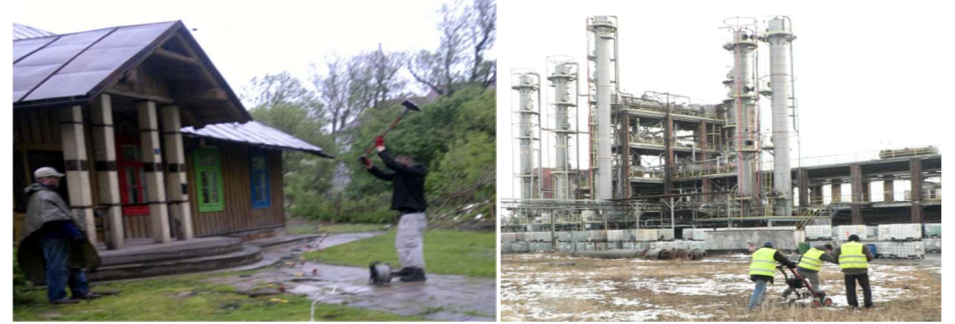
Fig. 5, Fig.6. Seismic measurement to search for underground rooms (chambers, tunnels) or their remains within the archeological site (on the left) and georadar measurement in the area of a chemical plant in an effort to identify the remains of old foundation, non-inventorized infrastructure as well as fuel tanks, carried out of the needs of a new investment (on the right) [20]

Engineering geophysical studies can be applied, among others, to identify ground in terms of the underground objects contained within it, such as, e.g. foundations, walls, reinforced slabs, non-inventoried rooms and infrastructure, etc. Studies carried out using various methods and techniques allow for precisely indicating their exact location under the surface of the studied terrain, which makes it possible to determine their geometric parameters [6]. These objects, if not removed prior to the commencement of groundworks, may interfere with or even make it impossible to carry out construction works for new investments, as well as expanding existing buildings [Fig.5]. The identification of such objects also holds importance when it comes to the proper placement of load-bearing elements of building structures.