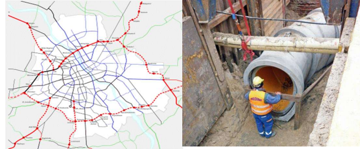
Fig. 9. New inner-city transportation routes [23] Fig. 10. New large-diameter installation infrastructure [24]

The location of development which ought to be reached by underground infrastructure indicates the necessity of setting aside areas intended for transportation (access to real estate). Technical installations (water and sewage, electrical and gas connects, etc.) supplying buildings are most often located in these transport routes. In accordance with the applicable laws in force, there are guidelines according to which proper distances ought to be maintained so that, in the case of failure of any of the connections of the underground installation, it is possible to safely remedy the damage, while not allowing other utilities existing in the ground to be damaged [11],[12]. The new roads which are being created as a result of the spatial development of urbanized areas create a publically available communication and transportation network [Fig.9]. Infrastructure constructed in such layouts, creates a network of underground installations of significant throughput and flows, generating increasingly greater diameters of pipelines supplying and removing municipal sewage and oftentimes even industrial sewage [13].