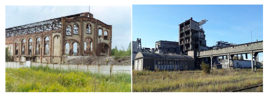
Fig.1, Fig. 2. View of post-industrial areas not in use for a few dozen years [17], [18]

Modern-day administrative procedures in the case of the lack of a current spatial development plan for a given area permit development conditions to be established via an administrative decision issued by local governments (the president of the city, mayor, voit)[Fig.1]. In such cases, as well as when administrative activities involving changes of an existing spatial development plan, are assumed, the carried out exploratory procedure does not contain information (as it turns out during the course of realizing new investment functions in post-industrial areas) regarding the signaled possibilities of former development or technical utilities occurring in a given area, which had been present or remain in this location. Selected historically documented areas of cities, e.g. old towns, are under preservation maintenance, and authorities responsible for providing such protection have been attempting to implement additional administrative solutions, e.g. the obligation to carry out archeological studies to gain more in-depth information on historical traces of human activity[Fig.2].