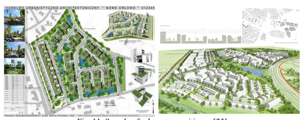
Fig. 11. Sample of urban compositions [25]

programming, e.g. by announcing urban planning competitions, until such areas are designated and accounted for [Fig.10].