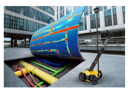
Fig.7. Georadar section for searching for unidentified objects, such as chambers, cellars and corridors, found in the area adjacent to the historic buildings. Abundant infrastructure, the remains of foundations as well as zones indicating the remains of other structures under the surface of ground can be seen [21]

The non-invasiveness of geophysical studies allows for cost-efficiency, saving time and high precision of identifying objects. Another branch of application of such studies is archeology, e.g. for the location of cellars, chambers, walls, tombs, tunnels and crypts [8]. Various geophysical methods area applied here, and their choice ought to be precisely adapted to the physical properties (e.g. dimensions, material which they are made of) of the objects being searched for, and the expected depth where they might be present in the analyzed medium[Fig.7]. This allows for optimizing the methodology and scope of given studies [9].