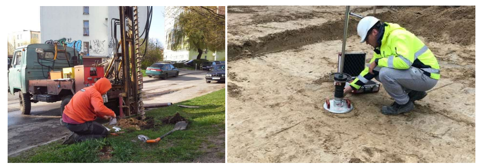
Fig.3. Example of collecting soil samples using an invasive method of geotechnical drillings Fig. 4. Simplified manner of obtaining geotechnical information on the land found directly beneath the planned development [19]

Carried out during the reconnaissance of land prior to assuming technical-design works or construction works are, e.g.: geotechnical studies in a rather limited scope showing information that is necessary for technical-design civil engineering and construction calculations. Current methods of determining the non-invasive type of terrain are, in some cases, especially useful when it comes to determining areas the development of which should additionally call for preparing documentation formulating, graphically and descriptively, the potential remains of former utilities or structures in the ground. Among such modern discovery methods are conductometric studies and analyses [Fig.3].