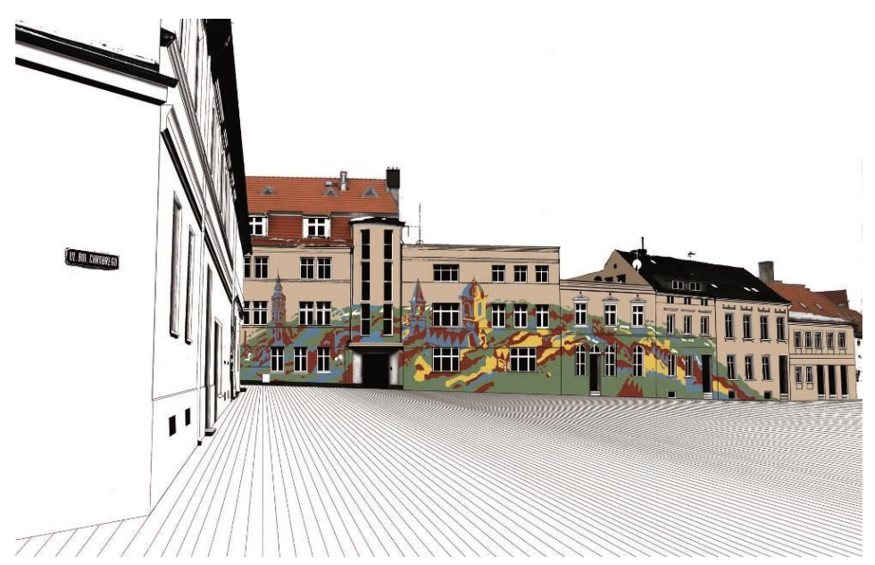
Fig. 1. A concept of restoration of Richard Kiełb's mural in J. Matejki Square. Elaborated by J. Sukienniczak

In addition, the concept of restoration includes a preliminary draft of a guest house at Niepodległości Avenue 9. The most important goal was to incorporate the new building into the historic tissue of a villa character. The newly designed building refers to the existing buildings (in terms of its dimensions, divisions of panes and materials). The function of the building is also not accidental. The street is built-up with stately service facilities, mainly cultural services. The existing functions are active during certain hours while the guest house would generate life all the time, which could have a positive impact on the security of this space.