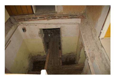
Fig. 3. Removing a part of the old ceiling