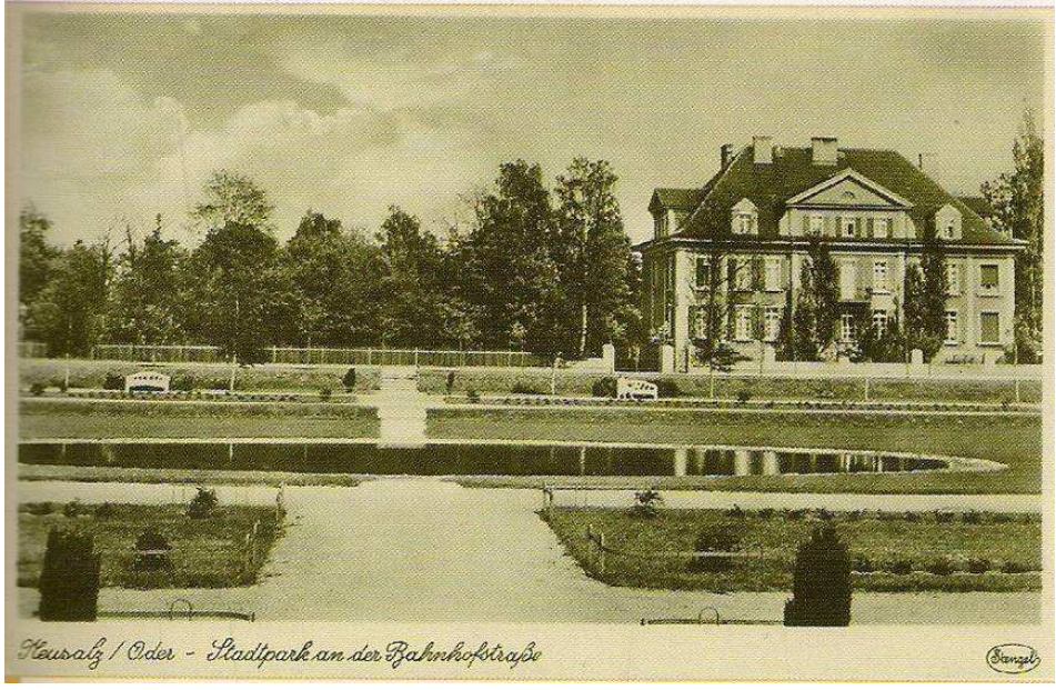
Fig. 1. View of the building from the direction of the city park. Postcard from the 30's of the XX century.

In 2007, the European Union project to transfer the City Public Library was commenced and reconstruction and renovation works on the building were initiated. The construction works were finished in 2010, and on 1 January 2011, the library began to operate from its new location.