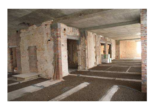
Fig. 5. Construction works on floors.