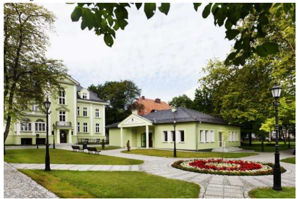
Fig. 6. New headquarters of the City Public Library.

The new MBP headquarters on Bankowa Street fulfill all qualities, esthetic as well as functional. The building, which had been falling into ruins during the time it functioned as doctors' clinics, was given a "second life". The elevation of the building was beautifully restored providing access to the handicapped and inside rooms were adapted to serve library functions. The library is equipped with modern electronic devices, which facilitate providing fast service to readers, ongoing registration of volumes and using electronic library cards. Halls for organizing book readings, meetings with authors and other cultural events are present in the building. The entire building is surrounded by a green park referred to as the Art Garden, where one can find, among others, a fountain, pergola, mini amphitheater, area for playing chess in the open air and parking places. As a result of such activities, a representative building which has been the home of the MBP since 2011 was created. The previous headquarters had been located in a building near the corner of Parafialna and Szkolna Streets. Despite applying modern devices and technologies, the MBP building has maintained its historic nature.