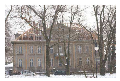
Fig. 4. Replacing the roof truss system