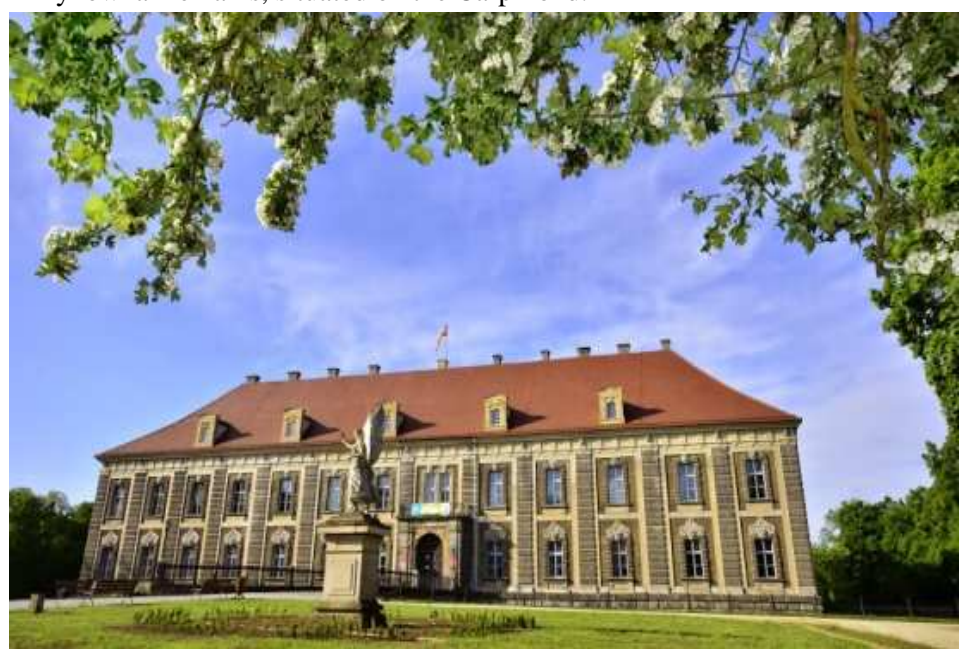
Fig. 1. View of palace from the north

The location of the building is also remarkable, as it is surrounded by a 400-hectare park with an over 70-hectare island. The palace-park complex had once been more developed. The park contained, among others, a Pheasant House, a Summer Palace, etc. Nowadays, only a single building referred to as "Młynówka" remains, situated on the Carp Pond.