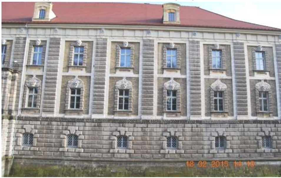
Fig. 4. Characteristic elements of the palace façade

The elevation of the building is in a simple vertical form. It was based on vertical, rusticated selvedges and a pattern of window openings in rusticated frames; their horizontal counterweights are the cornices. The crowning of the decorations are the ornamental reliefs of faces composed into the keystones of the windows and the ornamentation of the crowning cornice. All of these elements suggest the fortress nature of the building (Fig. 4).