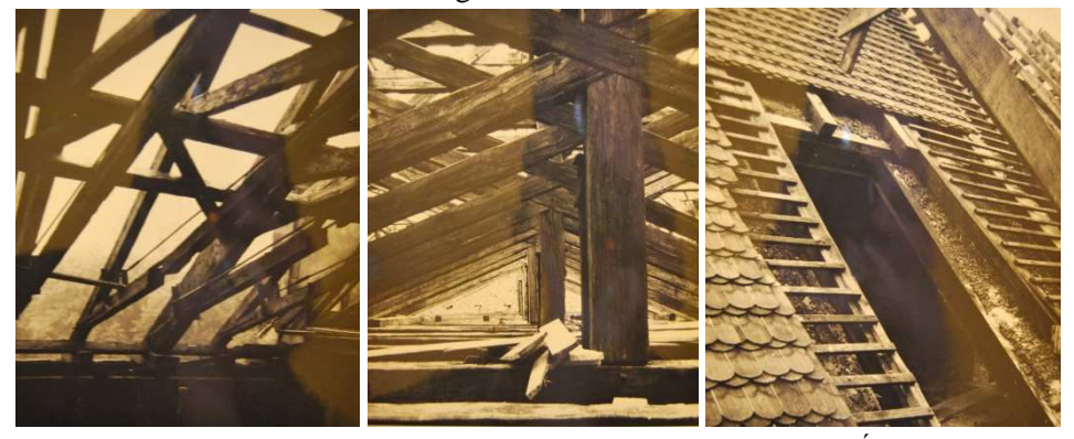
Fig. 5-7. Photographs of the palace roof taken in 1972

construction materials arose. However, thanks to the determination of the director, who arranged for the majority of the materials when dealing with other, more significant investments, or "half legally", it was possible to carry out the works on a more or less regular basis.