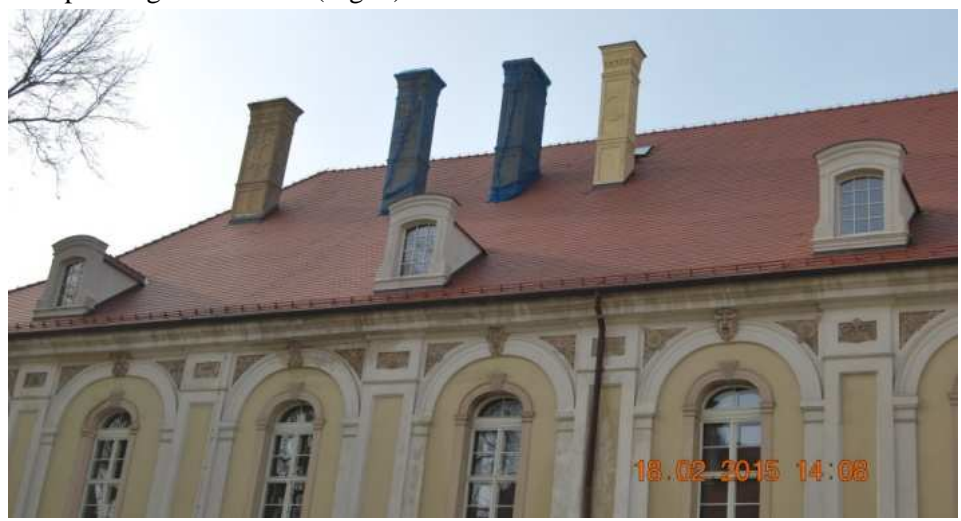
Fig. 9. Technical state of chimneys not subjected to renovation works (fot. W. Sokołowski)

The project was co-financed from European Union funds. The revitalization works made use of the above-mentioned design, prepared when Adam Stawczyk was the director. The park was returned to its prior state from the XVI century. Self-sown trees and shrubs were cut down, the old layout of paths returned, and new plantings carried out (Fig. 8).