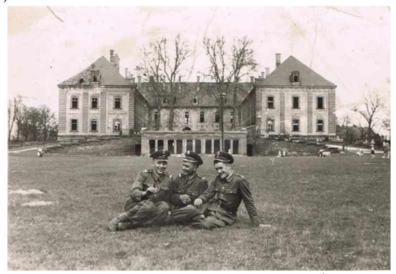
Fig. 3. South elevation of the Palace in Żagań

The palace survived the period of the Second World War in relatively good condition, as the Duchy of Żagań continued to belong to France this entire time (Fig. 3).