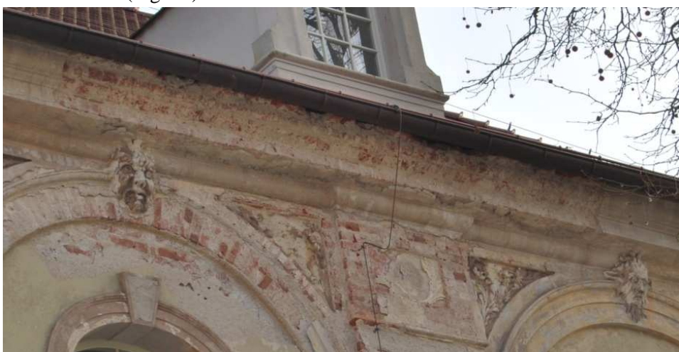
Fig. 10. Deteriorating east façade

What is more, in the area of the courtyard, the system for draining water from the roof was implemented incorrectly, resulting in water damage to the newly redone facade (Fig. 10).