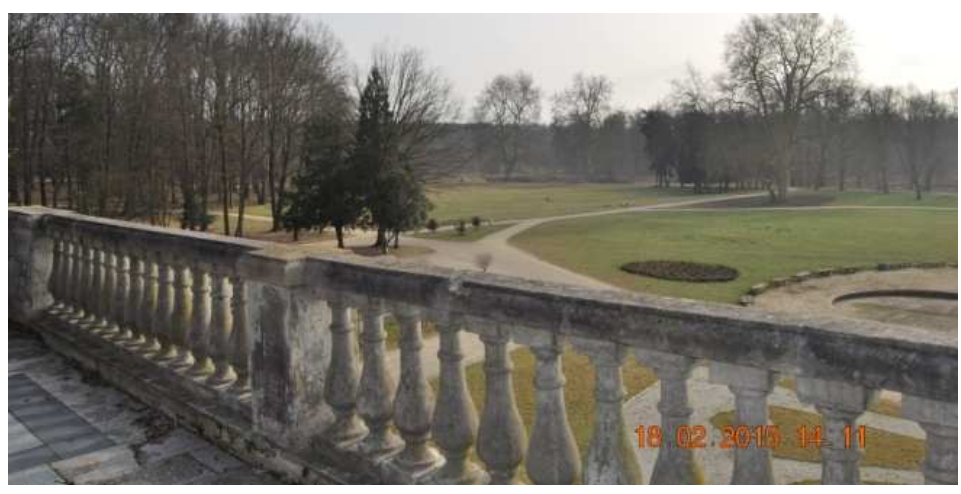
Fig. 8. View of the park following renovation

The project was co-financed from European Union funds. The revitalization works made use of the above-mentioned design, prepared when Adam Stawczyk was the director. The park was returned to its prior state from the XVI century. Self-sown trees and shrubs were cut down, the old layout of paths returned, and new plantings carried out (Fig. 8).