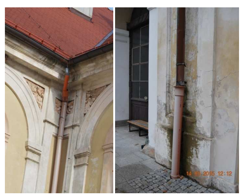
Fig. 12, 13. Existing connections of the downspouts on the east façade