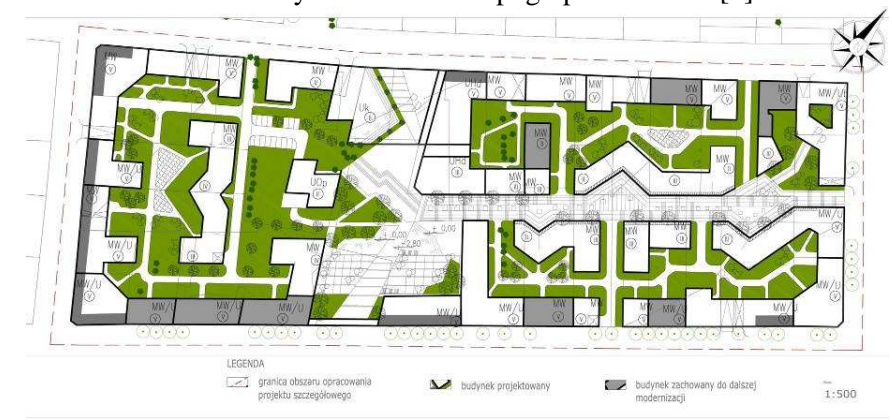
Fig. 3 An example of the concept of modernization of the building quarter of "New Praga", general area of building: approx. 80 thousand square metres, 950 flats, building intensity - 2 Source [9]

very affluent, create a specific, unique community of "former Praga", which still retains its individuality of moral and topographic nature.<sup>6</sup> [7].