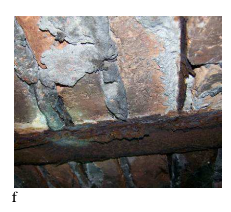
Fig. 2. Townhouses of Pachulski, 2a-view from the backyard, 2b - woodcuts on existing trees, 2c-wall defects in the facade from the Stalowa street, 2d-damaged exterior pillars, 2e-strong scratch of structural walls, 2f- corrosion of the steel beams of the basement floor.