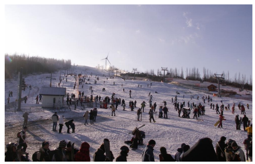
Fig. 4. A view on the ski run and sleigh track in Góra Kamieńsk in the Bełchatów mine