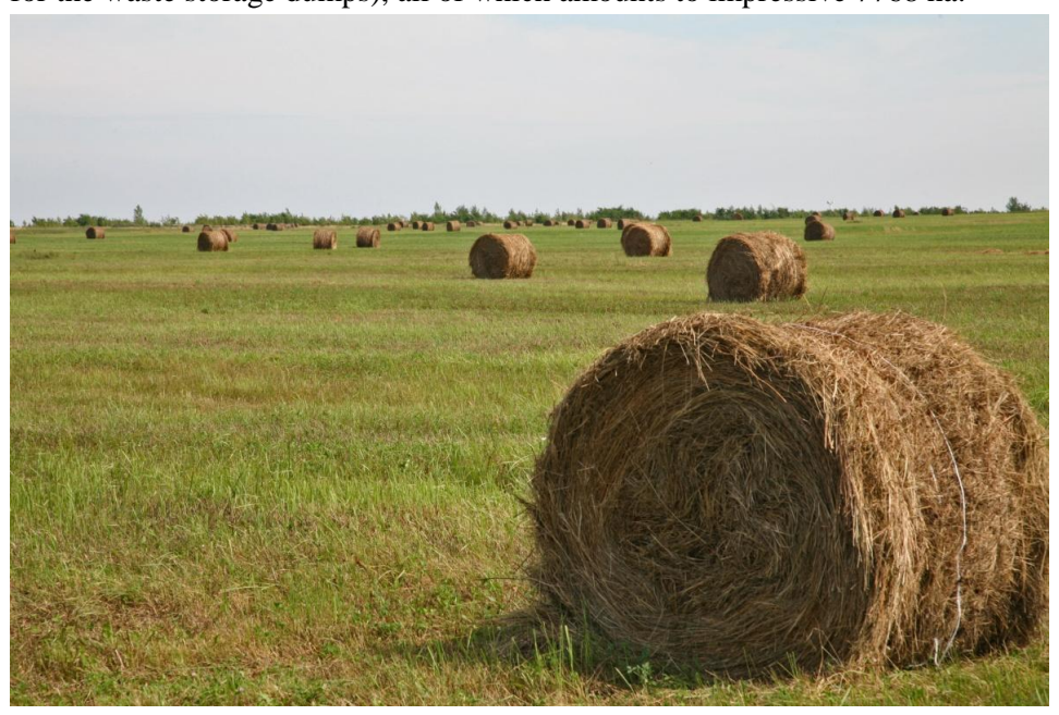
Fig. 2. Lucerne crops on the dumping ground of the Konin mine Lubstów open-pit

purposes 2185 ha, for forestry 928 ha, and as regards water and special approaches - 514 ha (including 165 ha of the Przykona water reservoir). In the case of the Konin mine the figures are significantly higher which is due to a much wider scale of operations. Till the end of 2010 the agricultural approach accounted for 3909 ha, forestry approach - 2402 ha, hydrological approach - 596 ha, recreational approach - 160 ha, and other approaches - 701 ha (it is mainly for the waste storage dumps), all of which amounts to impressive 7768 ha.