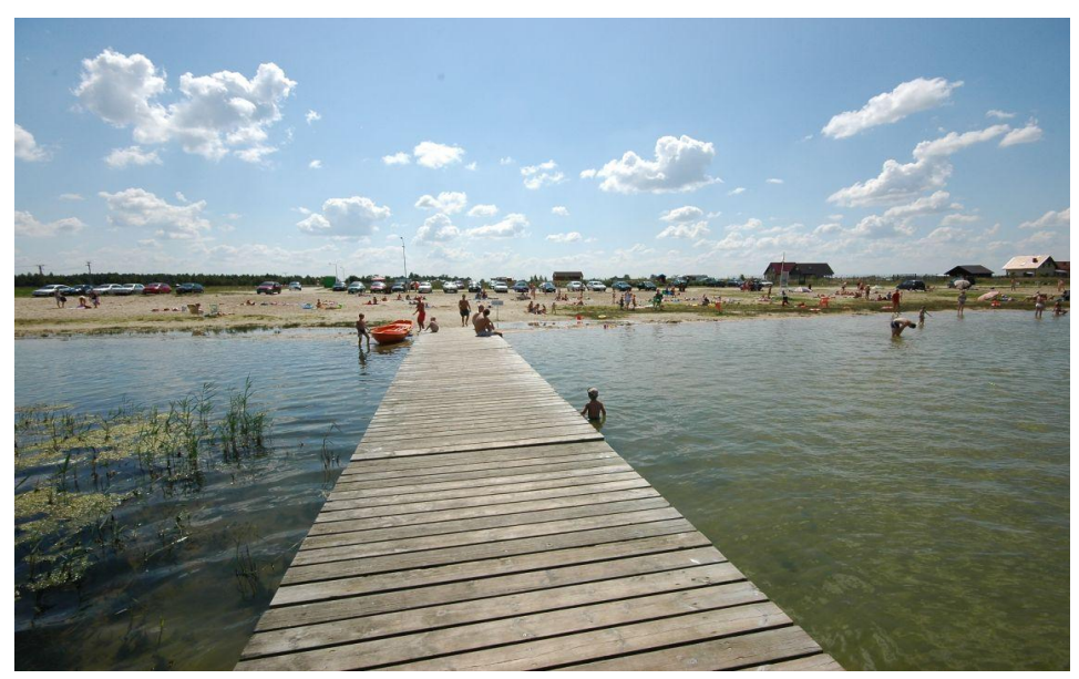
Fig. 7. Jetty on the Przykona water reservoir in the Adamów mine

The above mentioned reservoirs are precious to local inhabitants as they provide a place to rest, create new jobs and increase the attractiveness of the neighbouring building lots.