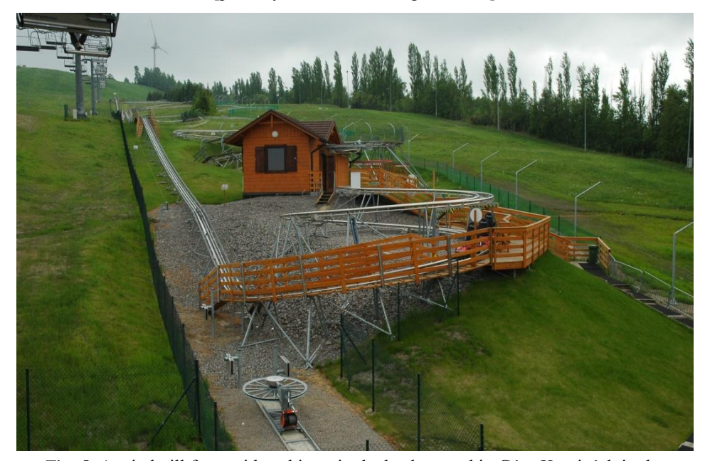
Fig. 5. A windmill farm with a ski run in the background in Góra Kamieńsk in the Bełchatów mine