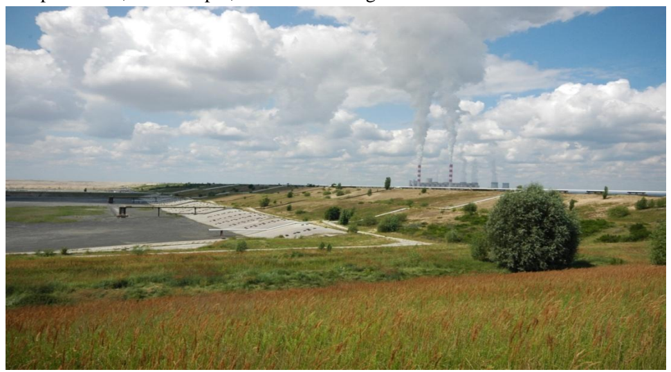
Fig. 8. Ash waste dump site for the Belchatów Power station on the internal dumping site of the Belchatów Field

So far the Polish lignite mining industry has not followed the cultural approach, and the economic approach has been present in a limited way - one could mention here, for example, the windmill farm on the external dumping site of the Bełchatów mine or the construction of industrial and municipal waste dumping sites in the workings and dumping sites of particular lignite mines. Internal dumping sites (e.g. in the Bełchatów, Konin and Turów mines) are sometimes used to store ashes from power stations and as a result they are rendered harmless there. It seems that in the field of promotion and application of reclamation approaches other than traditional ones there is a lot to do in comparison to, for example, our western neighbours.