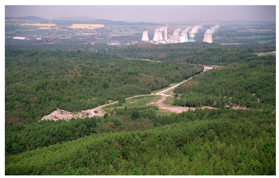
Fig. 3. View of the external dumping site of the Turów mine