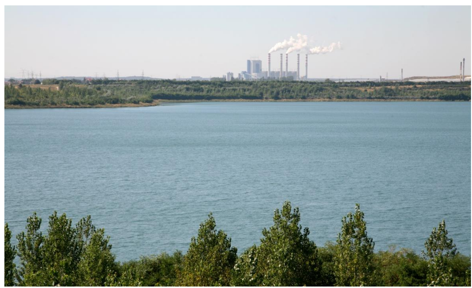
Fig. 6. The biggest water reservoir in the lignite mining sector on the site of the Patnów open-cast in the Konin mine

Due to the single open-cast character of the exploitation the hydrological approach to reclamation in the Turów and Belchatów mines consisted mainly in the creation of small water ponds in the external dumping sites. However, the situation is different in the case of the Adamów and Konin mines that have several open-casts. The former one constructed three medium-size reservoirs: Bogdałów, Przykona and Janiszew that serve the inhabitants as recreational sites in hot summers. The Konin lignite mine has the greatest experience in hydrological reclamation. So far 6 water reservoirs of the total area of 600 ha have been built. They are located in the former workings of the Niesłusz, Gosławice, Patnów, Jóźwin IIA and Kazimierz Południe open-casts. The reservoir in the Patnów open-cast is at present the biggest lake in the lignite mining with a surface of around 350 ha and a volume of almost 90 mln m<sup>3</sup>. In the reservoir in the Lubstów open-cast, where the exploitation finished in 2010, reclamation is being carried out aiming at the construction of the biggest postmining reservoir in Poland - bigger than the Machów reservoir - with the surface of over 480 ha and volume of almost 150 mln m<sup>3</sup>.